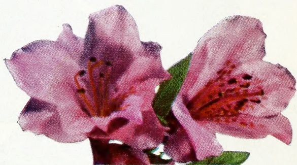
AZALEA HERBERT (Gable)